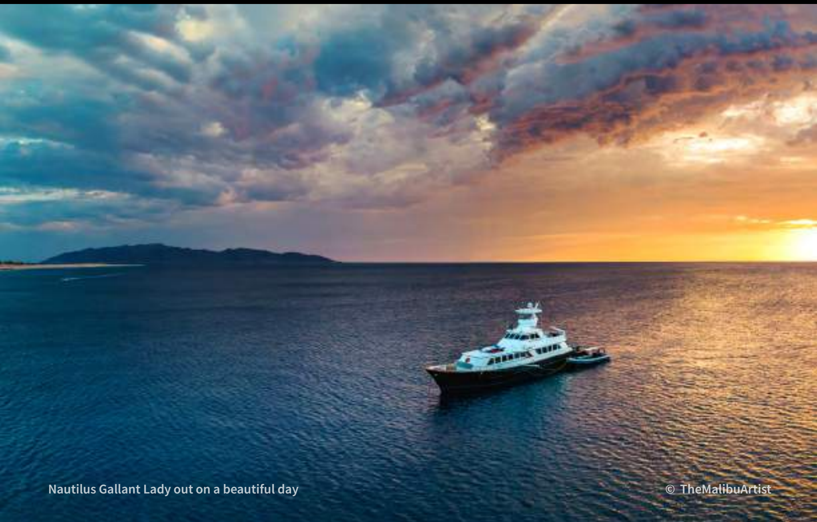
Nautilus Gallant Lady out on a beautiful day