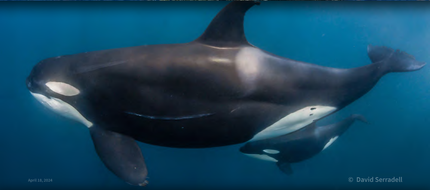
April 18, 2024