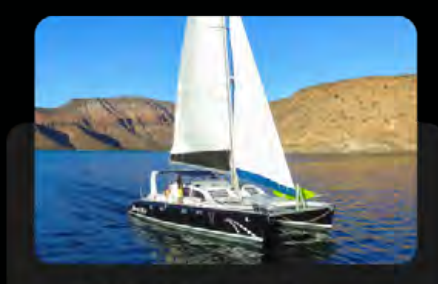
45-ft Sailing Cataraman