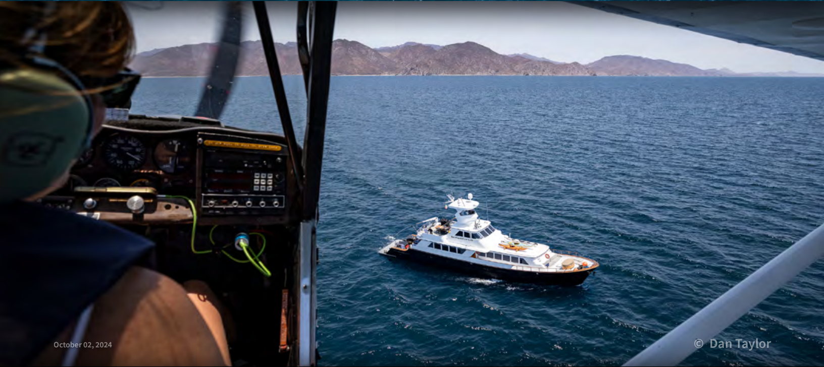
October 02, 2024