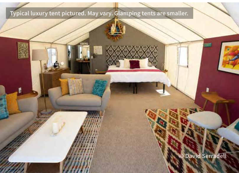
Typical luxury tent pictured. May vary. Glamping tents are smaller.