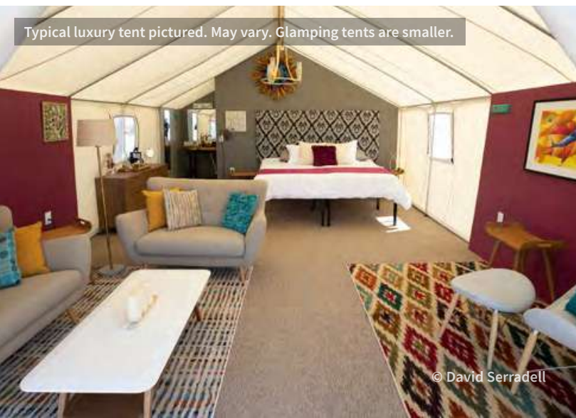
Typical luxury tent pictured. May vary. Glamping tents are smaller.